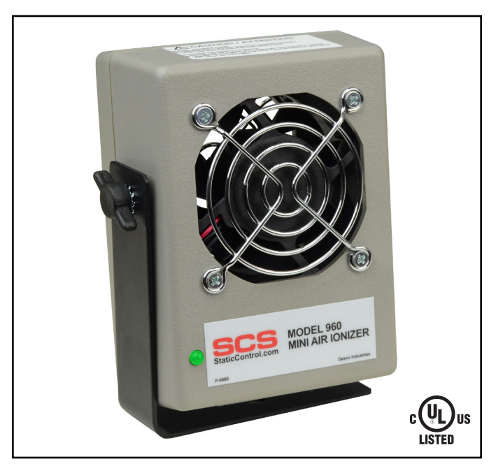
Figure 1. SCS 960 Mini Air Ionizer